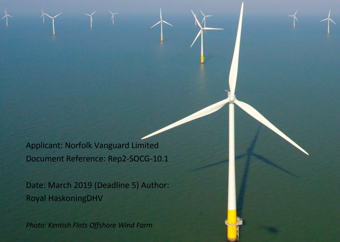
Photo: Kentish Flats Offshore Wind Farm

Date: March 2019 (Deadline 5) Author: Royal HaskoningDHV